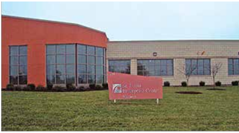
St Louis Enterprise Center – Wellston