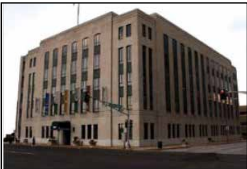
BEGIN New Venture Center – St. Louis