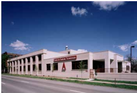
Center for Emerging Technologies - St. Louis