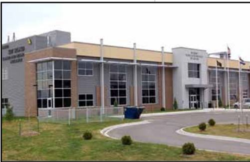
Christopher "Kit" Bond Incubator – St. Joseph