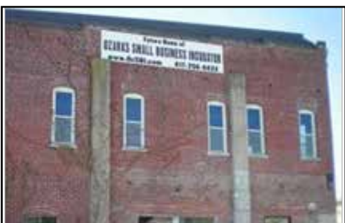
Ozarks Small Business Incubator – West Plains