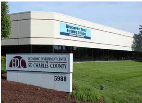
Small Business Synergy Center – St. Charles