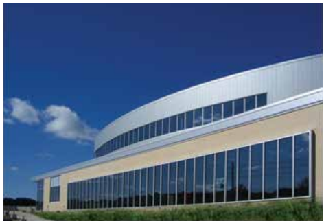
Life Sciences Business Incubation Center- Columbia