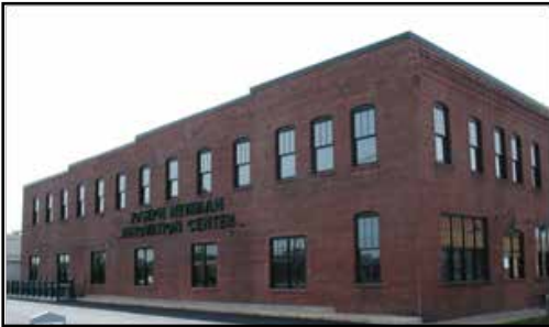
Joseph Newman Business and Technology Innovation Center - Joplin