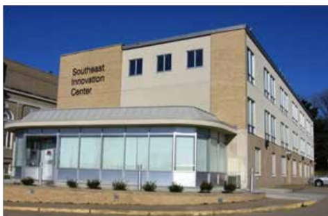
Southeast Missouri Innovation Center (SMIC) – Cape Girardeau