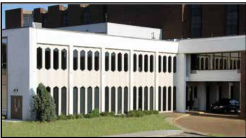
Independence Regional Innovation Center – Independence